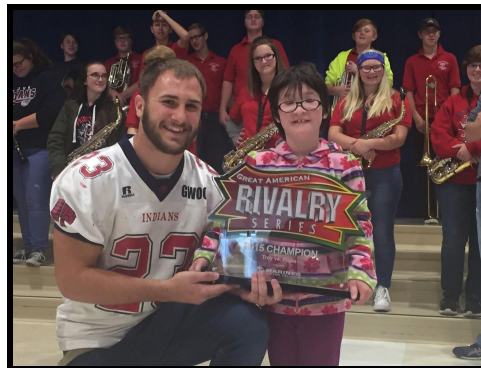
GO INDIANS! What a great pep rally with the High School Cheerleaders, Pep Band, and Football Players.