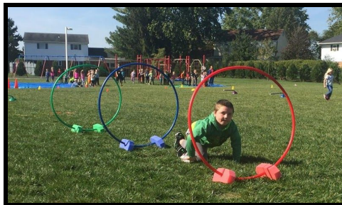
Students have a great time participating in our healthy kids obstacle Course.